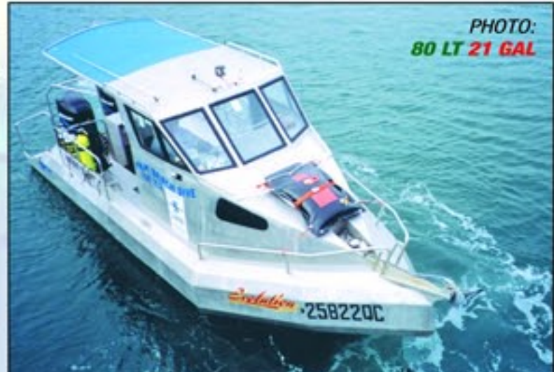
PHOTO: 80 LT 21 GAL